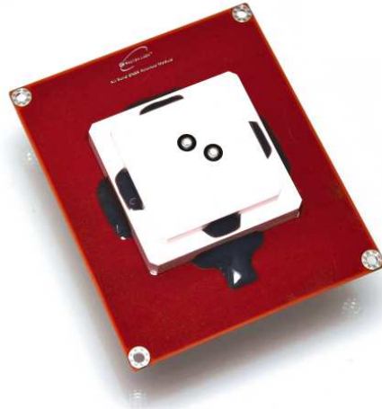
Fig. 3 Engineering Model of the piPATCH-AllBand unit with red Remove Before Flight finish.

To test the GNSS system aboard the satellite prototype or engineering / development / qualification model, the Engineering Model grade with identical electrical and RF properties is available. The red Remove Before Flight finish with respective label reminds the user to replace the unit with the Flight Model grade unit suitable for the environment of space. Photo of the piPATCH-AllBand/EM unit is depicted in Fig. 3.