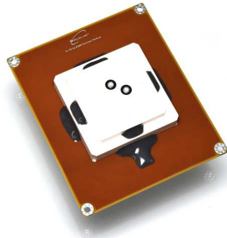
Fig. 1 piPATCH-AllBand/FM Patch Antenna Flight Model.