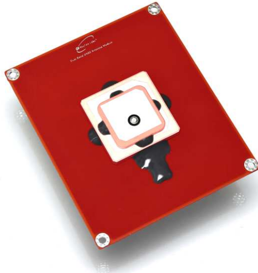
Fig. 3 Engineering Model of the piPATCH-DualBand unit with red Remove Before Flight finish.

To test the GNSS system aboard the satellite prototype or engineering / development / qualification model, the Engineering Model grade with identical electrical and RF properties is available. The red Remove Before Flight finish with respective label reminds the user to replace the unit with the Flight Model grade unit suitable for the environment of space. Photo of the piPATCH-DualBand/EM unit is depicted in Fig. 3.