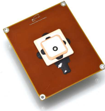
Fig. 1 piPATCH-DualBand Patch Antenna Flight Model.